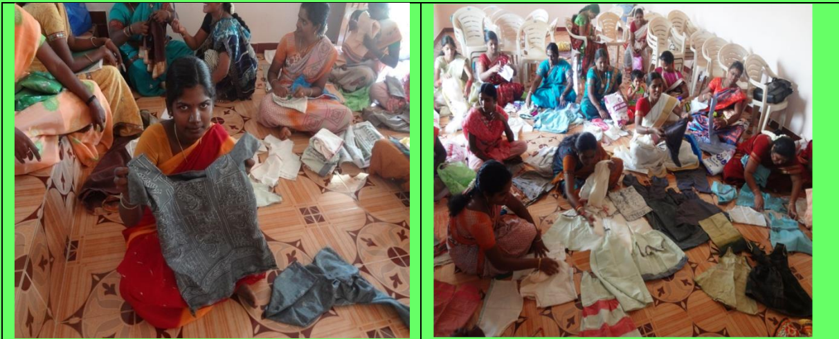
Trainees are seen with finished children's dresses