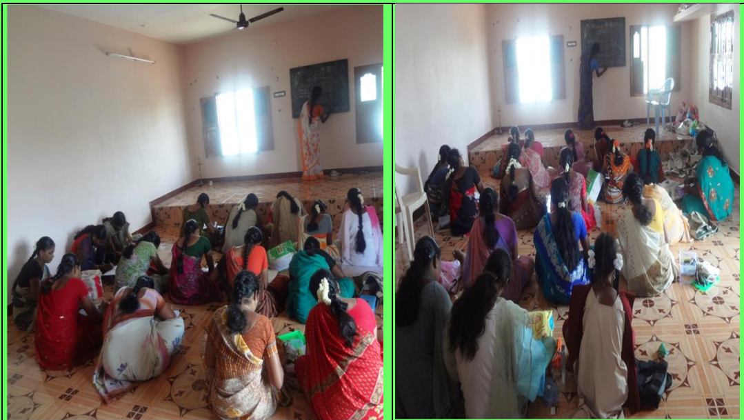
The trainees are keen in theoretical session