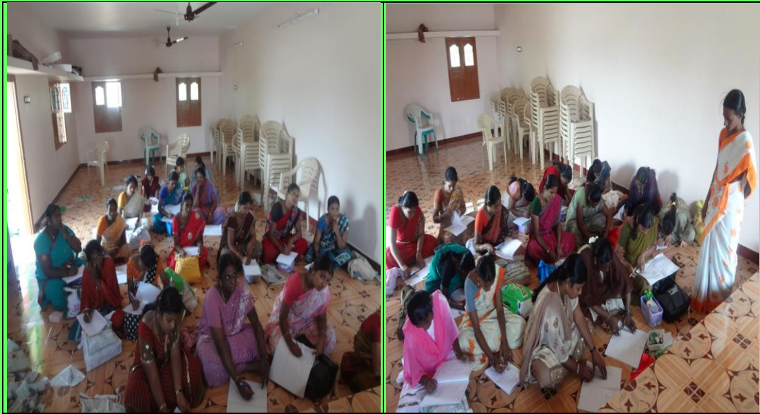
The trainees engaged in Drawing of various designs of Kids wear